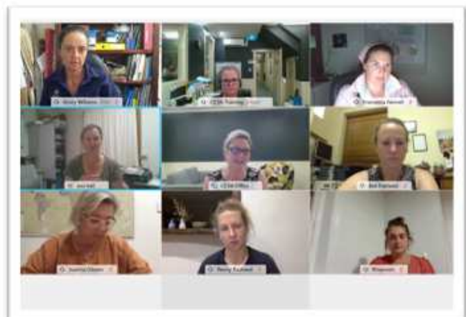
MEMBERS OF THE BOARD STRATEGIC PLANNING SESSION #1 WITH CCSA